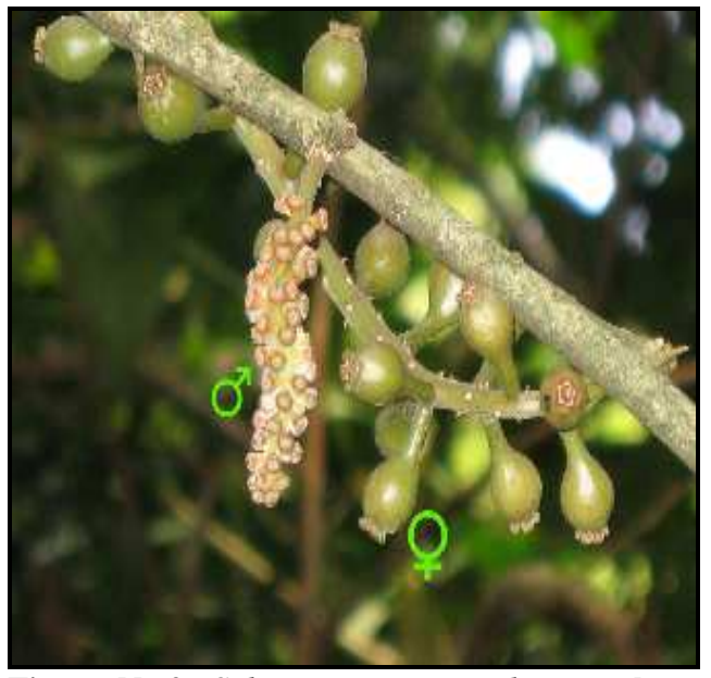
Figure No.2: Scleropyrum pentandrum male and female flowers

including an increasing number of publications per year, it is highly difficult to relate the countless reports on the antimicrobial action of these products in this review article about a subject of such a great complexity, which requires a multidisciplinary approach.