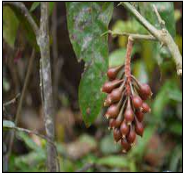
Figure No.1: Scleropyrum pentandrum

extraction procedure. The traditional healers use primarily water as the solvent but we found in this study the plant extracts by methanol provided more consistent antimicrobial activity. Therefore, given that the literature on tests for the antimicrobial action of plant Scleropyrum pentandrum is broad,