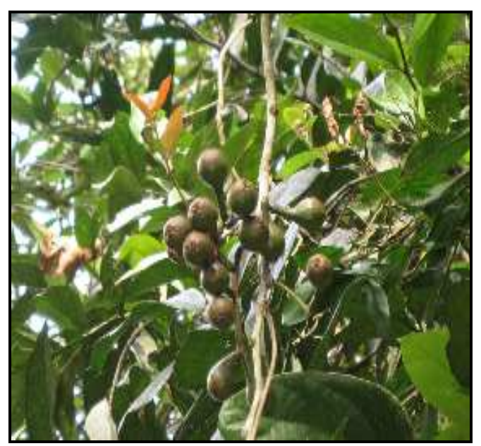
Figure No.4: Scleropyrum pentandrum fruits