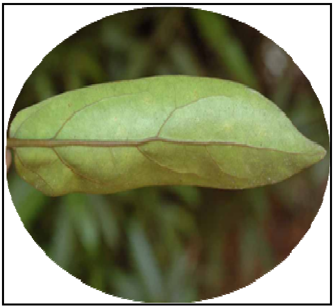
Figure No.3: Scleropyrum pentandrum leaf

including an increasing number of publications per year, it is highly difficult to relate the countless reports on the antimicrobial action of these products in this review article about a subject of such a great complexity, which requires a multidisciplinary approach.